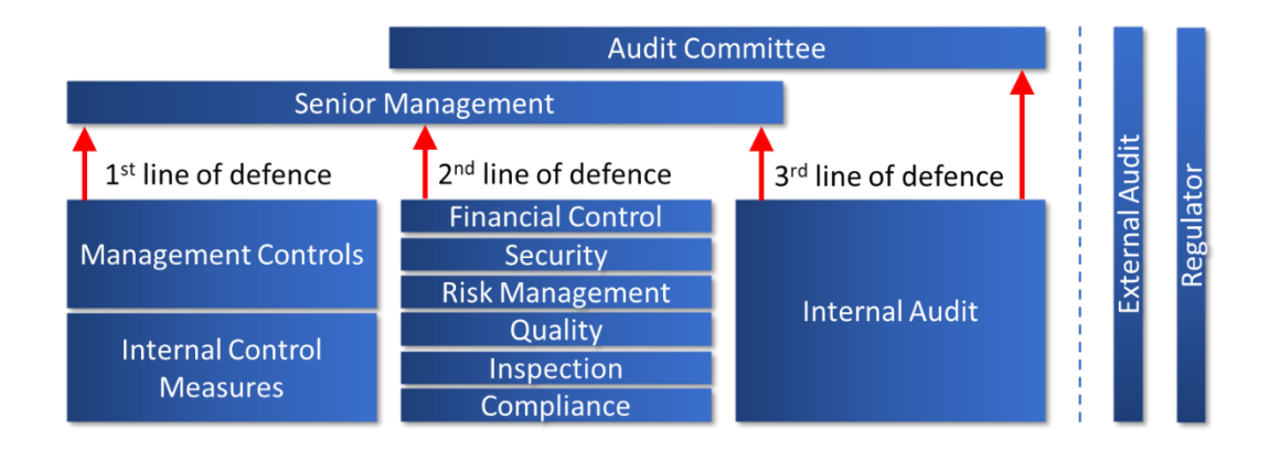
Figure 1: Three lines of defence model

Different parts and levels of an organisation play different roles in managing risk, and the interplay between them determines how effective the organisation as a whole is in dealing with risk. The Institute of Internal Auditors uses a "three lines of defence" model to explain internal audit's unique role in providing assurance about the controls in place to manage risk: